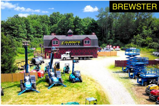
The Seven New York Durante Rentals Locations The Bronx, Brewster, Carmel, Flushing, Elmsford, Mt. Vernon and West Nyack