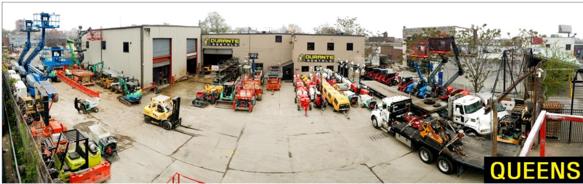
133-58 31 st Dr, Flushing, NY 11354 (behind Pathmark)