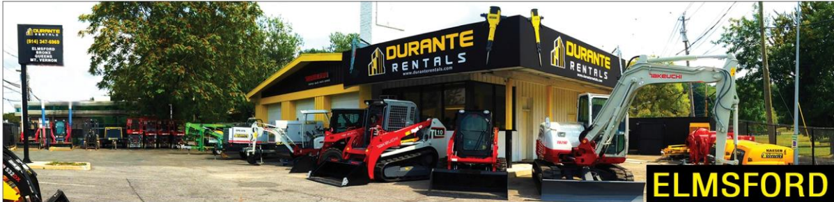
122 N. Saw Mill River Rd, Elmsford, NY 10523 (across from Paul Bunyan)