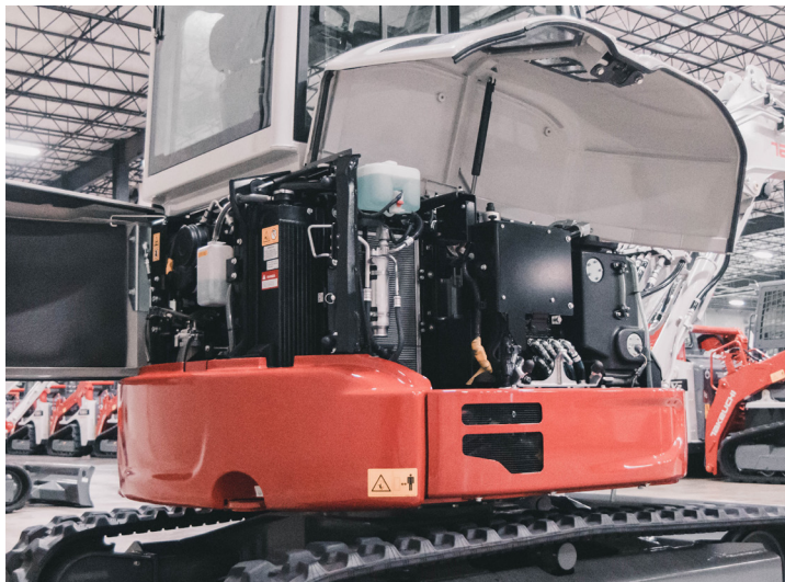
Easy Service Access with Wide-Opening Hoods