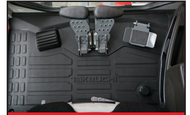
Large Floor with Foot Rest

The latest 300 series excavator, the TB335R features a minimal tail swing design that allows you to focus more on the work you are performing and worry less about rear swing impacts. Operators will find that the compact radius of the TB335R will provide excellent maneuverability and accessibility to confined worksites without sacrificing stability. While powerful bucket and arm crowd forces and a wide working range will deliver unmatched performance.