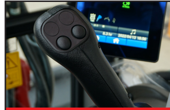
Hydraulic Joystick Controls