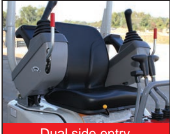
Dual side entry