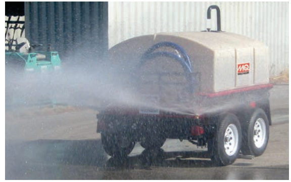
Rear spray bar produces a 30' cone pattern using water pump pressure or a 9' cone under gravity pressure.