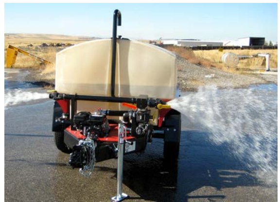
Full left/right 2" discharge demonstrated.